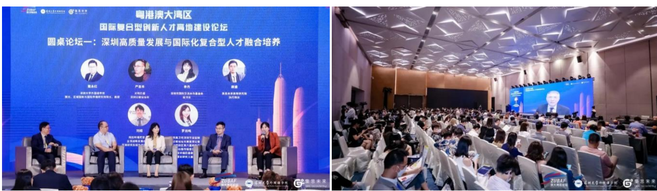
A panel discussion on the cultivation of international interdisciplinary talent.

The forum, jointly organized by the College of International Studies of Shenzhen University and the GEC Academy, consisted of three parts: several opening speeches, six keynote speeches, and three panel discussions.