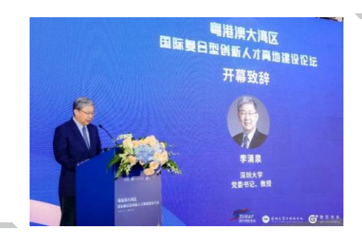
A view of the forum at Qianhai.

Cultivating international interdisciplinary talents has become an important task for Shenzhen University's targets of realizing international development and building itself into a world-class innovation-driven university. The university's College of International Studies has taken the country's lead in opening several disciplines' literacy and general knowledge courses for foreign language majors to cultivate their interdisciplinary learning capabilities.