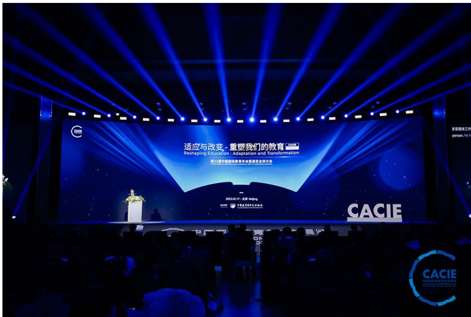
People attending the Plenary Session of China Annual Conference and Expo for International Education at Beijing International Conference Center

The 23rd China Annual Conference & Expo for International Education (CACIE) was held both online and offline at the Beijing International Conference Center on February 17, 2023, with the theme of “Reshaping Education: Adaption and Transformation”. Organized by the China Education Association for International Exchange (CEAIE), the event brought together educators, scholars, and representatives from various universities, institutions, and academia to discuss the current state and future of education.