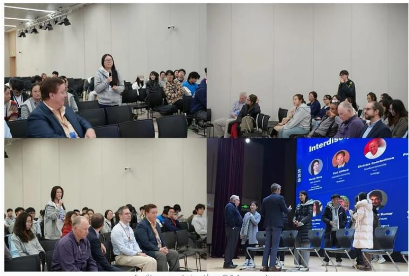
A glimpse into the Q&A session

The faculty meeting concluded with an insightful Q&A session, where our esteemed professors graciously responded to the doubts and inquiries raised by students on various aspects of the topic, for example, the concept of green development and the factors to consider when deciding whether to explore green technology or invest in industries. Students also raised questions regarding academic passion, environmental awareness, and the use of large language models, fostering a deeper understanding of the complexities surrounding green talent cultivation. This exposure to real-world examples and success stories not only motivated students to pursue careers in green technology but also instilled a sense of responsibility and urgency in tackling global environmental issues.