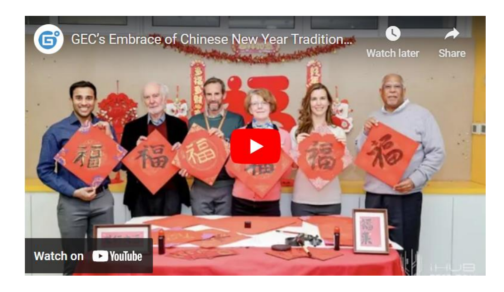
Click HERE to watch the video on YouTube!

In the vibrant landscape of Chinese cultural festivities, Xiao Nian, or the Minor New Year, traditionally celebrated on the 23rd day of the twelfth lunar month, holds a special place as it ushers in the Chinese New Year with rich traditions and anticipatory joy. This year, on February 2, the iHUB campuses in Beijing and Shenzhen captured the essence of this auspicious occasion by organizing a unique calligraphy event titled "Writing Blessings for the New Year." Aiming at blending tradition with educational innovation, the event offered an immersive experience into the art of Chinese calligraphy, inviting teaching faculty, teaching fellows, teaching assistants, students, and GEC staff to delve into a practice deeply rooted in Chinese heritage.