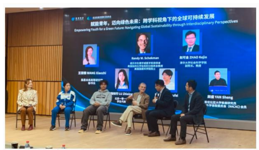
A glimpse into the roundtable session focusing on Empowering Youth for a Green Future: Navigating Global Sustainability through Interdisciplinary Perspectives

The forum also featured insightful keynote speeches focusing on "Building Trust and Connections Through Communication" and "Preparing for Success in University and Careers", coupled with a roundtable on "Empowering Youth for a Green Future". These sessions saw experts and students engage in fervent discussions about sustainable global development, exchanging unique perspectives and constructive insights.