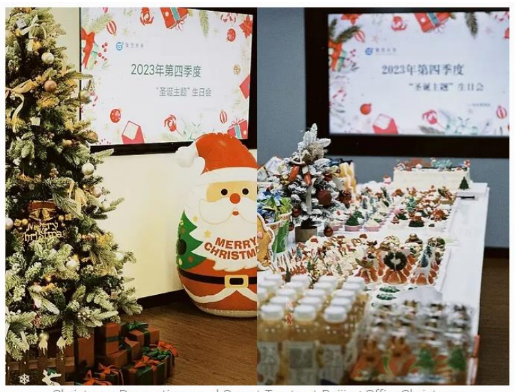
Christmas Decorations and Sweet Treats at Beijing OfficeChristmas Decorations and Sweet Treats at Beijing Office

On December 22nd, GEC Academy brought a touch of Christmas magic to its end-of-year birthday celebration. While the main event unfolded in the Beijing office, regional offices in Shanghai, Shenzhen, Guangzhou, Suzhou, Tianjin, and Chengdu also hosted their own charming celebrations, each adding a unique touch to the festive spirit. GECers gathered to share in a special celebration, marking not just another year gone by, but the warmth and camaraderie that defines the GEC family.