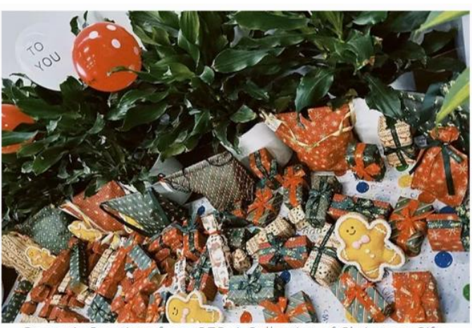
Season's Greetings from GEC: A Collection of Christmas Gifts

The offices were transformed into cozy, inviting spaces, with twinkling lights and charming Christmas decorations creating a festive yet intimate atmosphere. Amidst the laughter and friendly chatter, tables adorned with an array of delightful Christmasthemed treats added a sweet touch to the occasion.