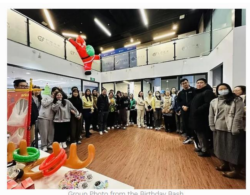
Group Photo from the Birthday Bash

Looking ahead to 2024, GEC Academy remains committed to nurturing this sense of community, ensuring that every team member feels valued and connected. Warm wishes, cheerful spirits, and a close-knit community – these are the gifts that GEC Academy cherishes as it steps into a new year full of potential and promise.