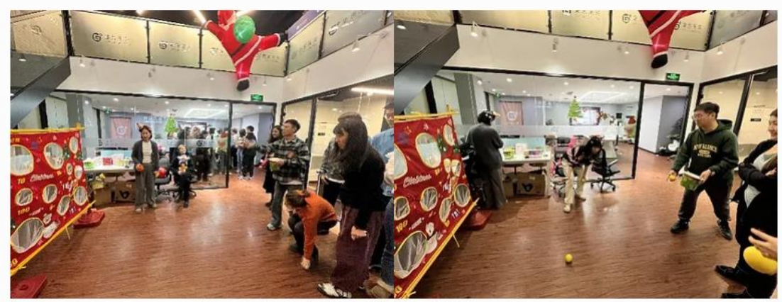
Fun at the Fair: Prize-Winning Ball Toss Game

This year's Christmas birthday bash at GEC Academy was more than just a celebration; it was a reflection of the collective spirit and joy that fills the halls of GEC. As employees shared stories and enjoyed the festive ambiance, there was a sense of gratitude for the year's successes and experiences.